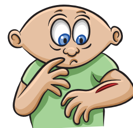
Infections or injuries heal more slowly than usual

For more information, visit Cornerstones4Care.com